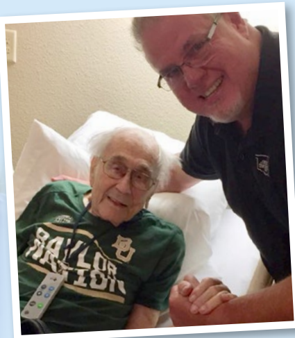
Above: "OTTOM was honored to be able to go to Puerto Rico and touch lives and Impact communities in the name of the ONE, who we serve, and the ONE who sends us...Jesus!"