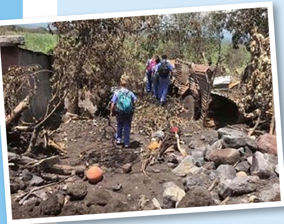
Above: Disaster-relief medical team walking in ash from the eruption of Volcan de Fuego. Ash covered houses and farmland remain destroyed by the eruption.