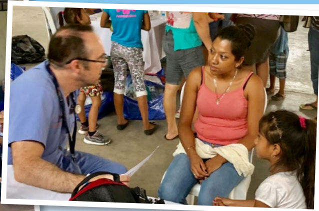
Left: Make shift clinic located south of Volcan de Fuego. Hundreds of people lined up for care.