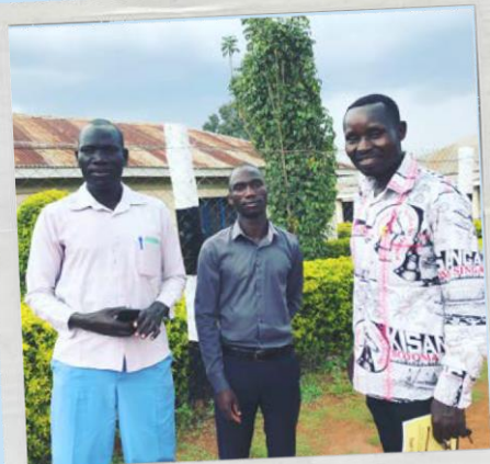
EPC Clinic Yei staff

Sudanese lives are impacted by the tireless generosity and kindness of Blessings' supporters.