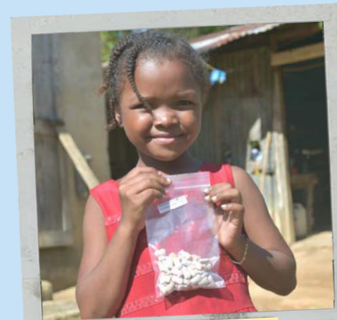
There are very few inhabitants of Roatán whose lives have not been touched by the compassion and generosity emanating from Clinica Esperanza.